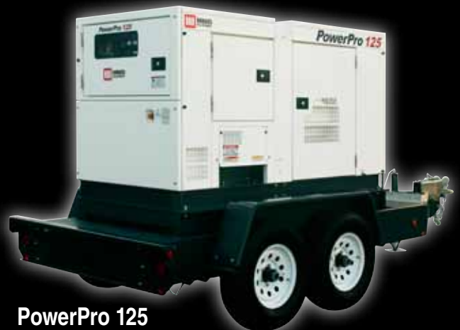
PowerPro 125 125 kVA Prime Power Tier 3 Flex Isuzu Diesel Engine