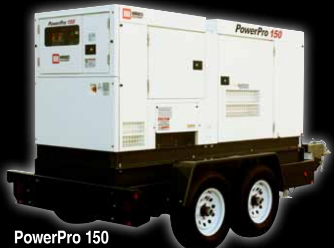
PowerPro 150 150 kVA Prime Power Tier 3 Flex Isuzu Diesel Engine