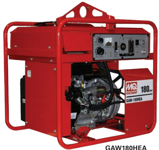
GAW180HEA 180 amp welder 3kW AC output Honda engine, recoil/electric start Battery sold separately Battery specifications: 12N243A / MQ# 0162212024