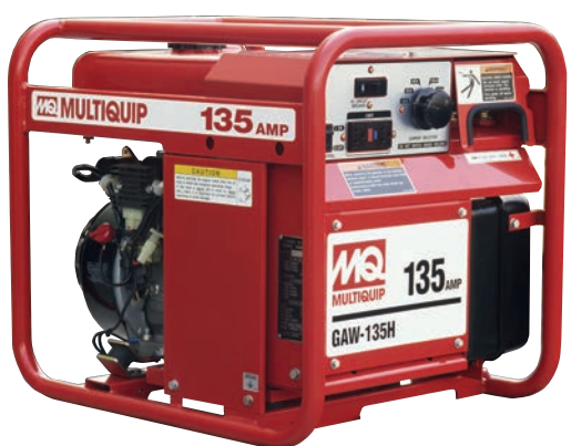
GAW135H 135 amp welder 1.5kW AC output Honda engine, recoil start

Multiquip welders deliver premium performance in sizes ranging from 135 amps to 500 amps. Whether you are looking for a gasoline-powered machine for small repairs or a large diesel-powered machine for service truck or industrial applications Multiquip has the best welders in the industry.