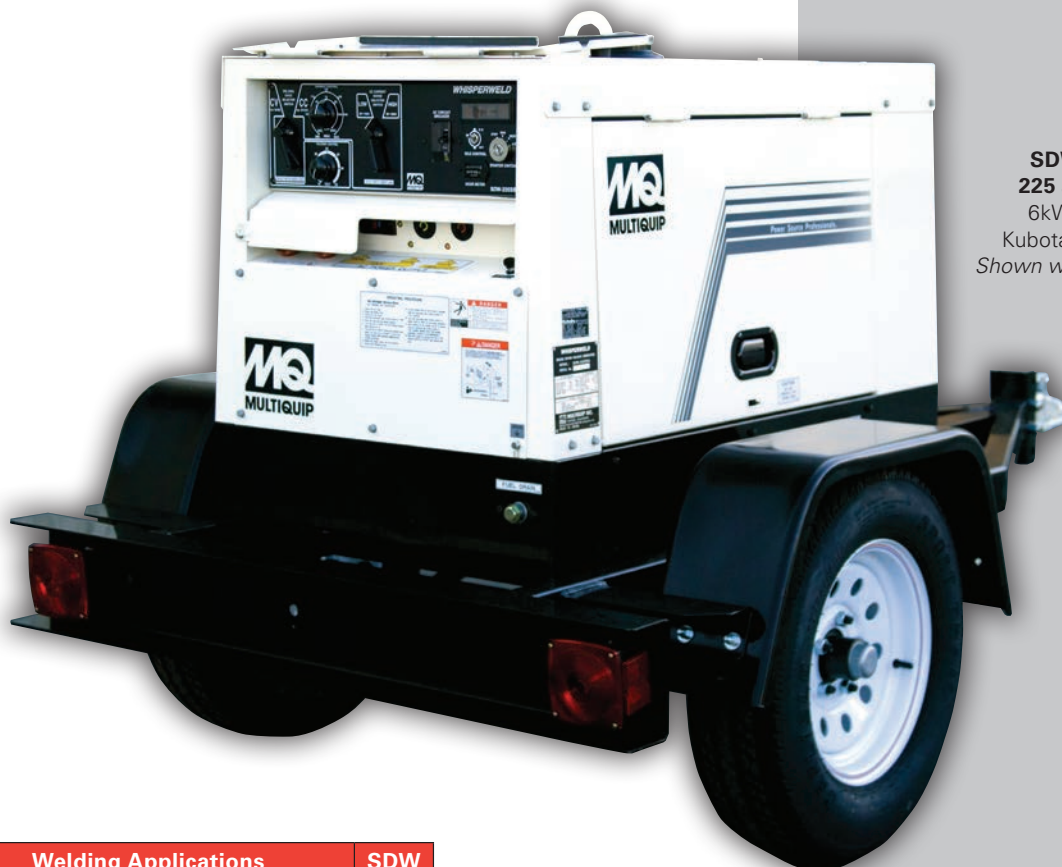
SDW225SSA1 225 amp welder 6kW AC output Kubota diesel engine Shown with optional trailer

Full instrumentation is protected by a lockable cover panel. Controls for both CC and CV welding, along with engine condition indicators, are included.